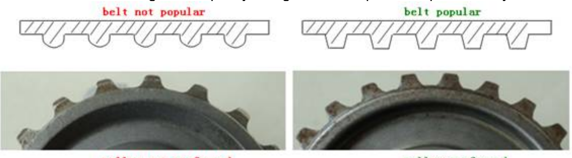
pulley not preferred

1). AUTOXUGA reflects belt on right in below picture is more popular and scientific than the one on left, due to this reason design of the pulley on right in below picture is preferred by customers.