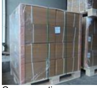
Our suggestion: AUTOXUGA PLT NO.:

6. Shipping mark (posted on pallet) (confirmed by Agustin by email)